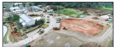
New Facilities Project—March 5, 2018

Updates, pictures and drone video on the new facilities project can be found on the City's website at www.sunsetvalley.org/newfacilities .