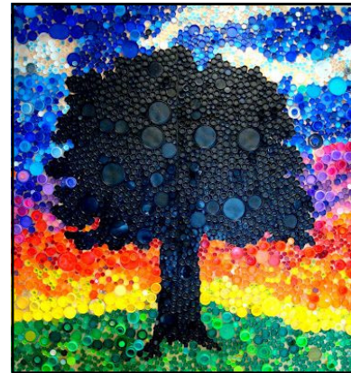
Recycled Plastic Bottle Top Art

So, that's a full day of fun, laughter, music and enjoyment. Join us!