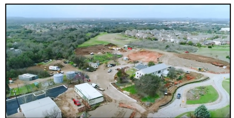
New Facilities Project—March 5, 2018